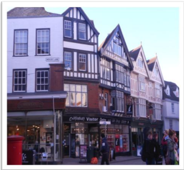
The town centre