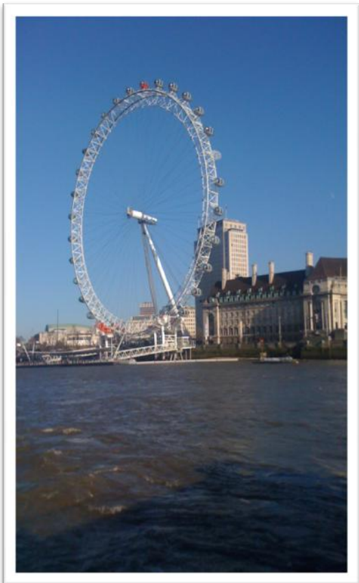
London Eye next to the Thames