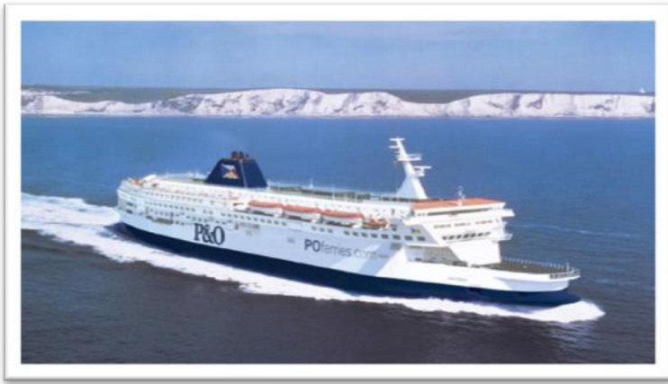
The ferry-boat sailing on the Channel and the Dover Cliffs