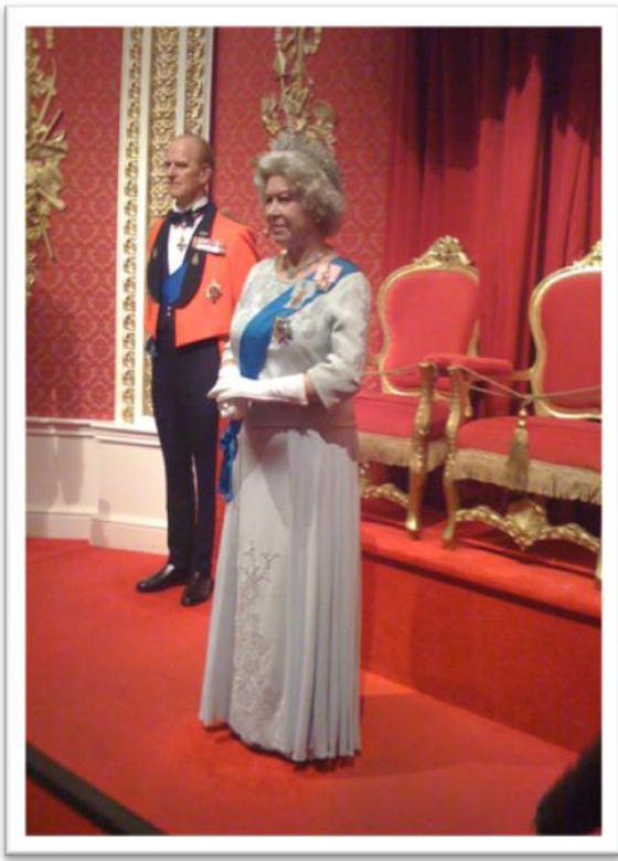
Queen Elisabeth II's statue in Madame Tussaud's Museum