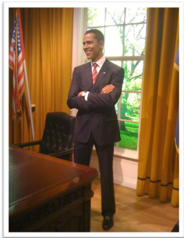
Barack Obama's statue in Madame Tussaud's Museum