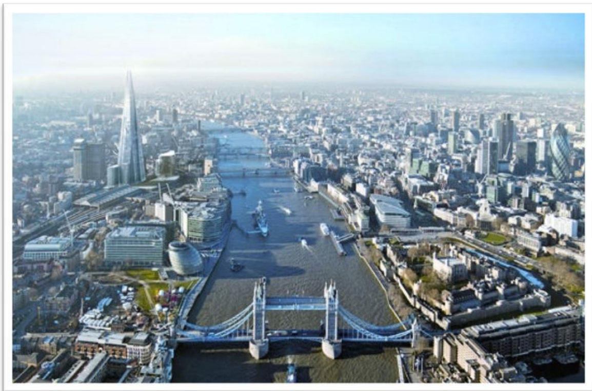
Aerial View of London

Photographs chosen by: Maxime-Rachel-Robert-Alexia-Haci