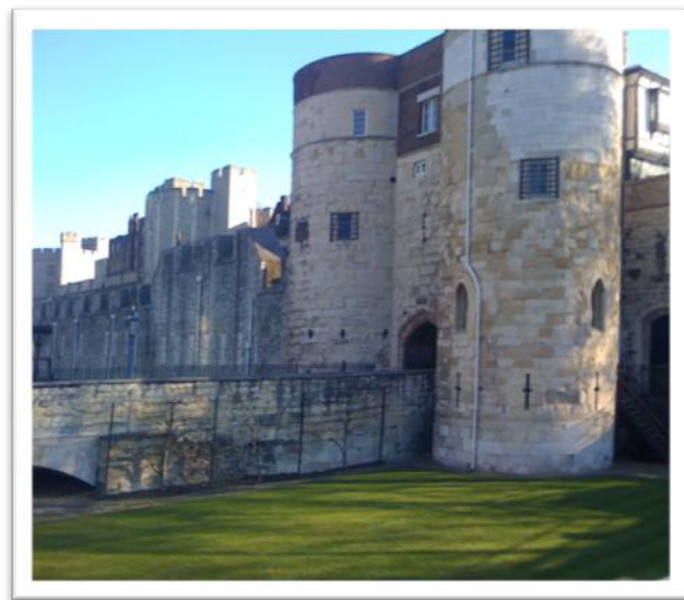
The Tower of London