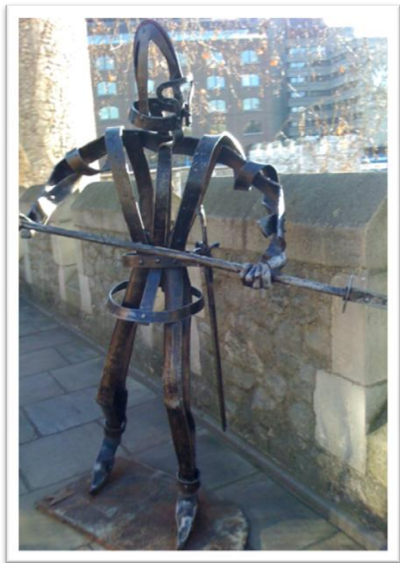
An iron statue in the Tower of London.